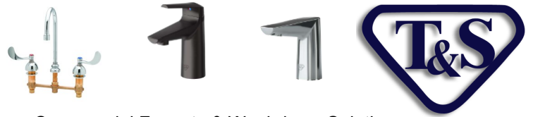
Commercial Faucets & Washdown Solutions